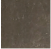
Machined aged solid brass - ASB